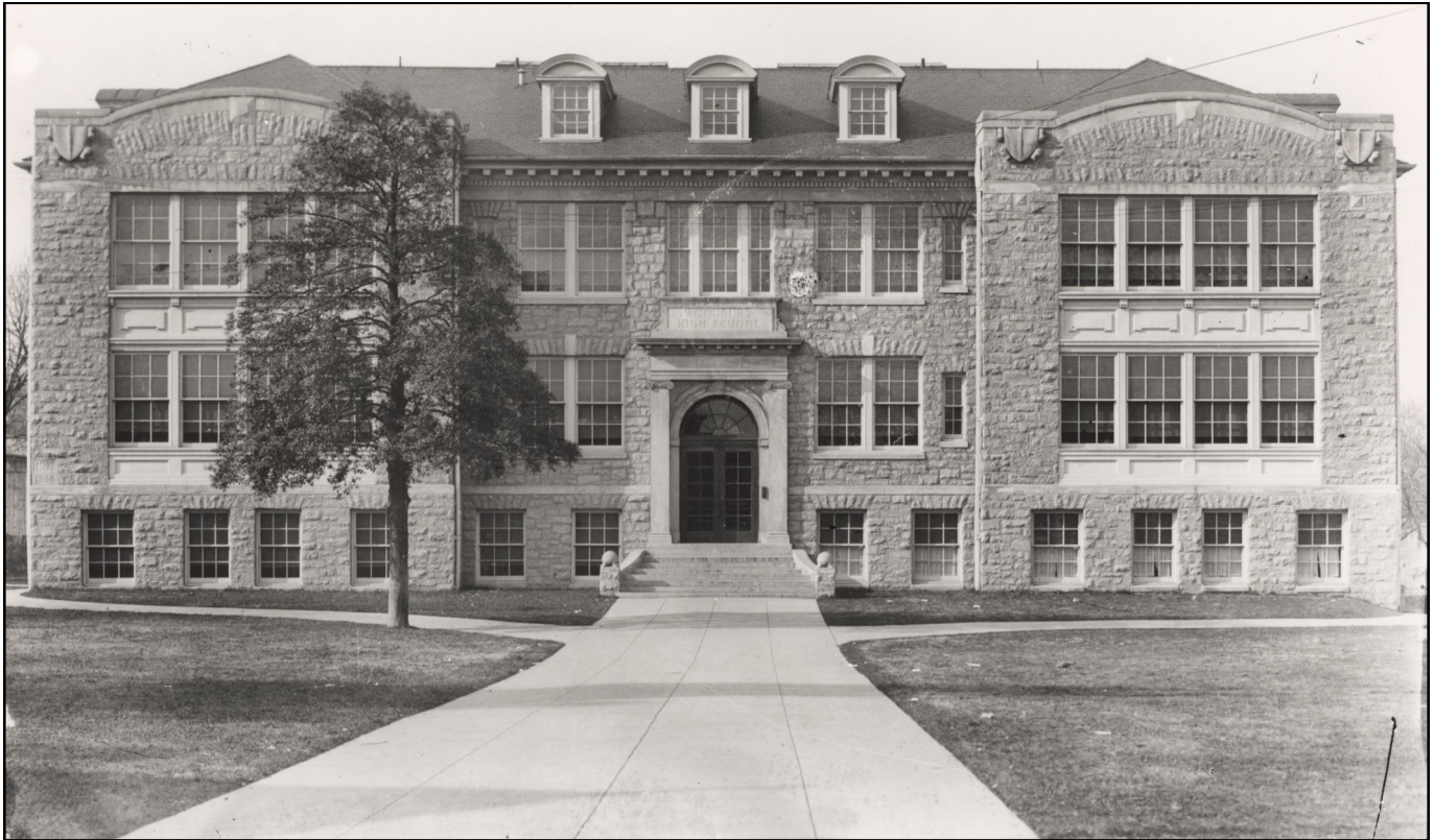
Woodbury High School, circa 1916-17 after the second fire

Friday, April 10, 2015 Volume 13, Issue 3, April 2015