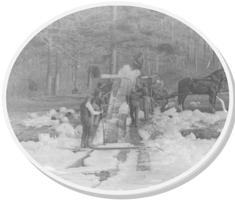
Ice Cutting on Wenonah Lake, circa 1900

B efore the advent of refrigeration, this was the time of year when ice houses were filled. Ice cutting was both a time-sensitive and high-pressure endeavor. Sudden increases in temperature or a blizzard could hinder the cutting and ice was necessary to preserve food throughout the year. Ice was retrieved from lakes, ponds or streams in the winter and stored in ice houses or pits for later use. On farms, streams were dammed to flood a meadow in the early part of the winter. Filling ice houses was hard work whether one used a saw, an axe or a mule-drawn wagon.