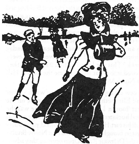
Another woodcut from the turn-of-the-century Times.

January 2001 Published by the Historical Society of Wenonah, NJ