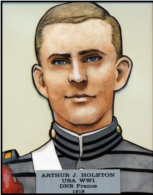
From the Gloucester County Wall of Heroes In the Gloucester County Justice Complex

“Fall In!” reported the Woodbury Daily Times on December 1, 1919. “Service men help round up everybody who was in the service and be at the Y.M.C.A. Hall at 8 p.m., on Thursday, December 4th, to form a Wenonah Post of the American Legion. Each man must come out to fix up the Charter. Remember Thursday at 8 for the kick-off.”