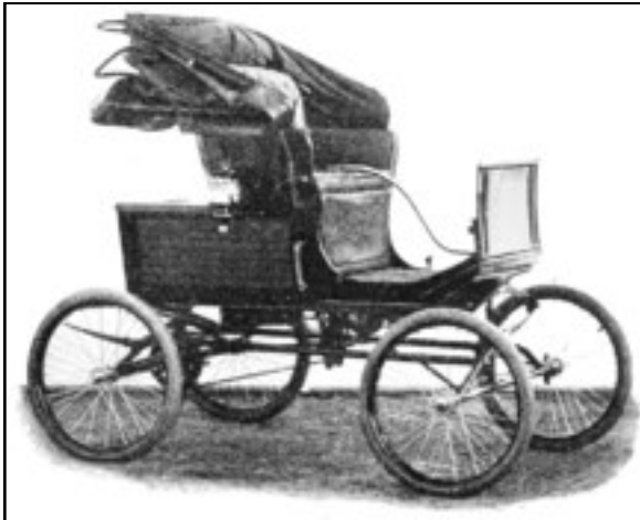
From Popular Science Monthly , Vol. 57 December 31, 1899

The contest was announced on the front page with a photograph of the grand prize, a 1900 Locomobile worth $750. The name of the vehicle was derived from combining the words lo comotive and auto mobile. An acceptable minimum wage at that time was about $8 per week. If you could somehow manage to put $1 a week away to buy the car you could expect to be driving in 15 years! Another way to consider the value of the prize was that houses built on the west side of the railroad tracks in Wenonah were supposed to be worth a minimum of $1,000 and houses on the east side $2,000. The top 20 contestants would get an expense paid trip to At-